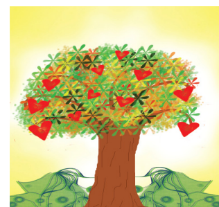
This picture represents the tree ceremony for homicide victims, where loved ones are remembered through the reciting of names and hanging of hearts.